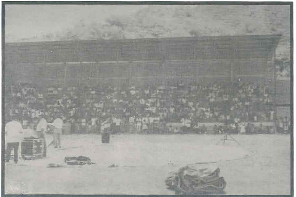
Part of the other side of the stadium