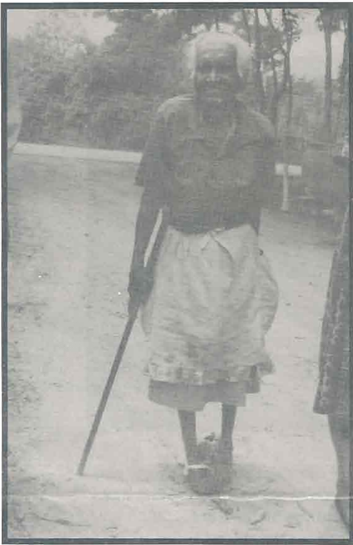
This dear lady's feet have been crippled since birth but she never misses a day in the kitchen.