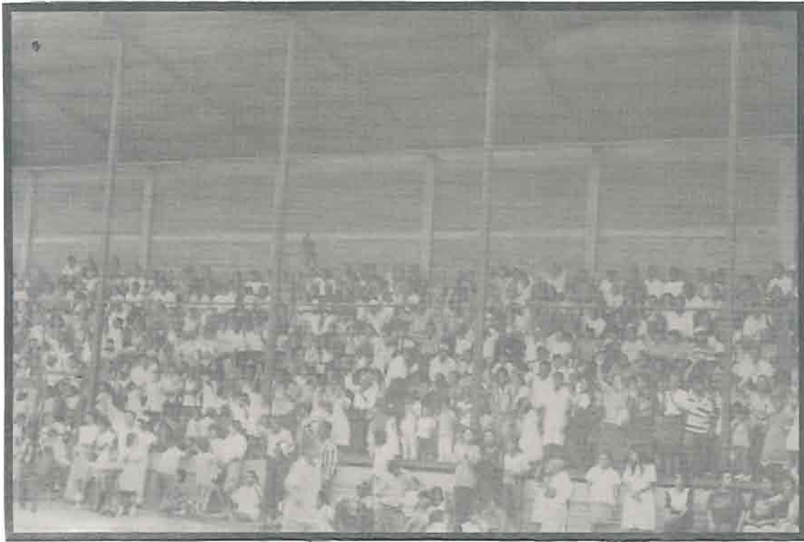
Part of one side of the stadium where the Anniversary was held