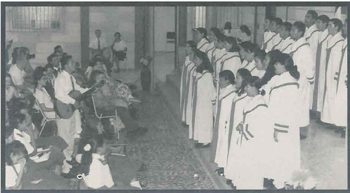
Good Samaritan High School Choir