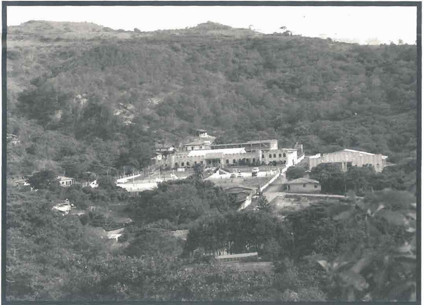
Good Samaritan High School, Girls Dormitory behind the High School, and new Grammar School to the right.

Christian Schools - Feed the Hungry - Church Planting - Child Sponsorship Bible Institute - Evangelism - Christian Radio Stations