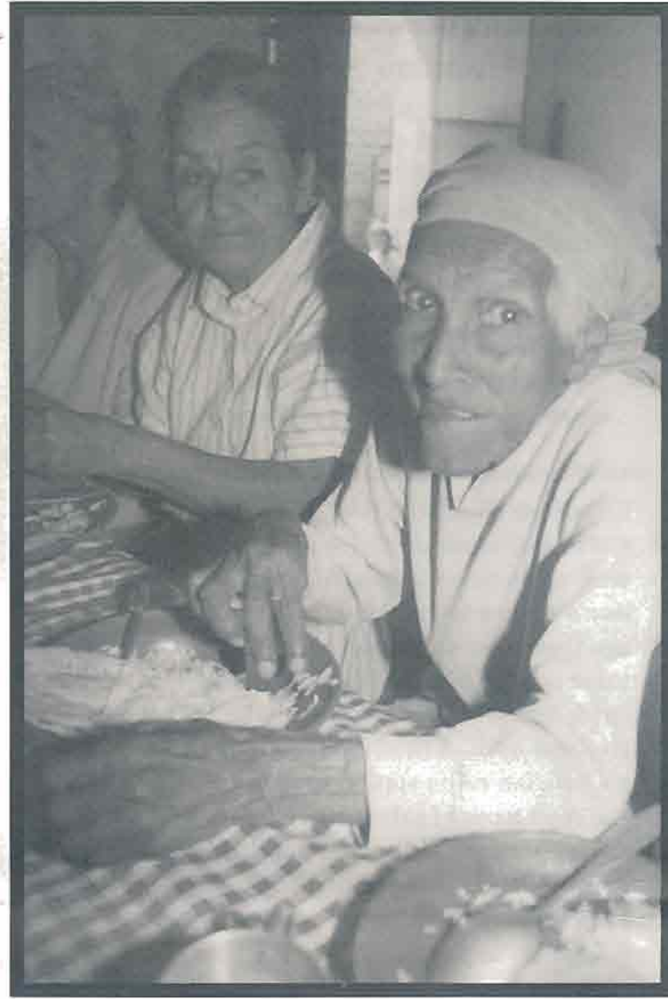
I was Hungry and Ye Fed Me”