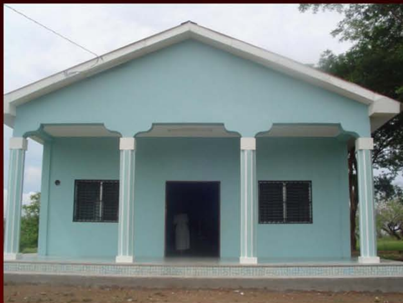
Construction finished in Papalon, Hon.