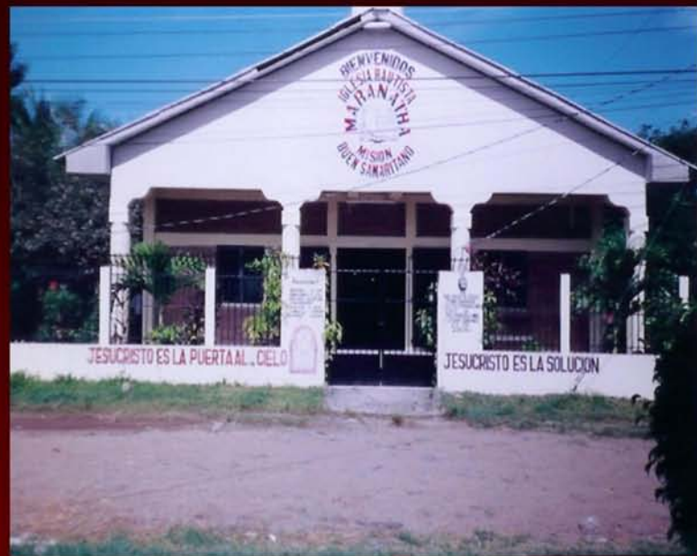
Maranatha Baptist in Choluteca, Hon