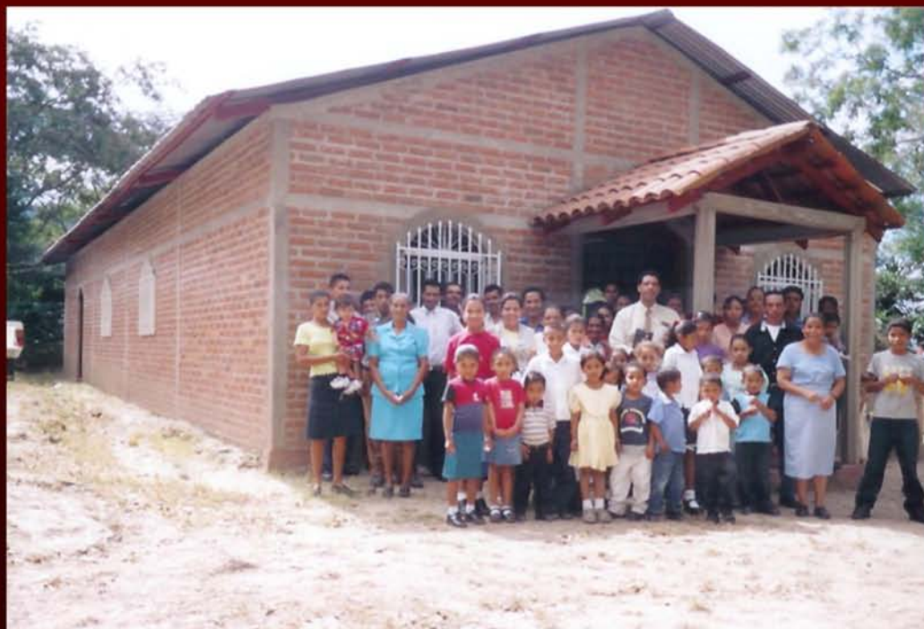
New remodeled church in Palagua, Nicaragua