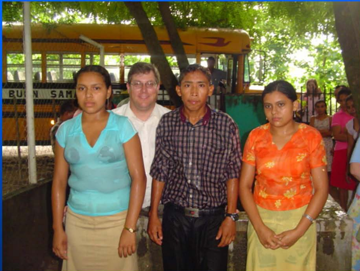
Baptisms in Los Tablones