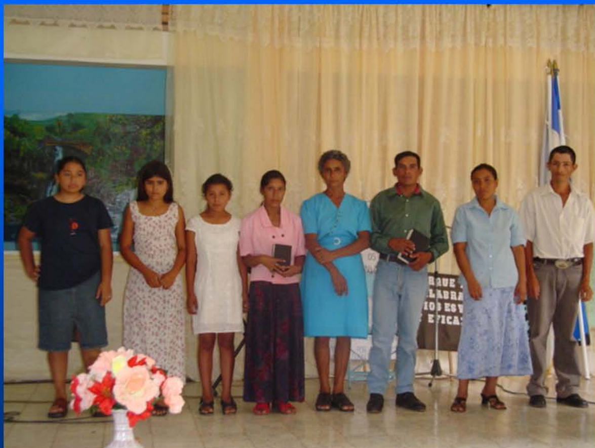
Baptism In Duyure