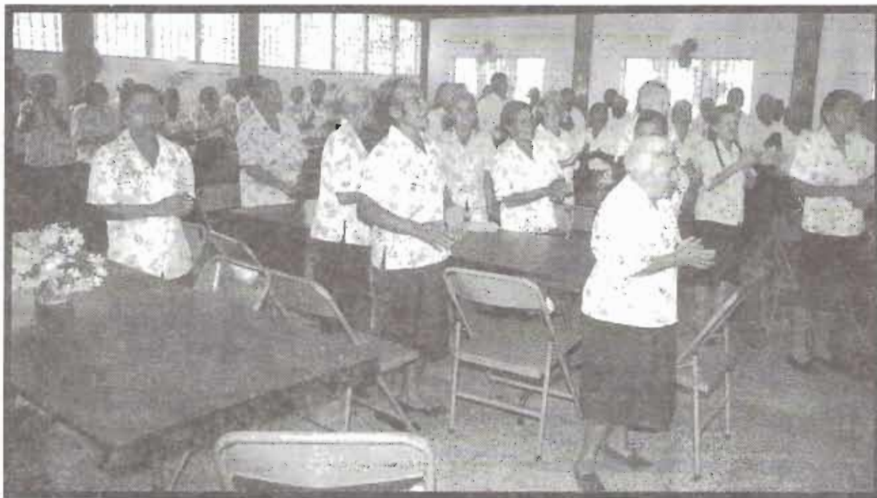
Here they are singing and giving thanks to the Lord!