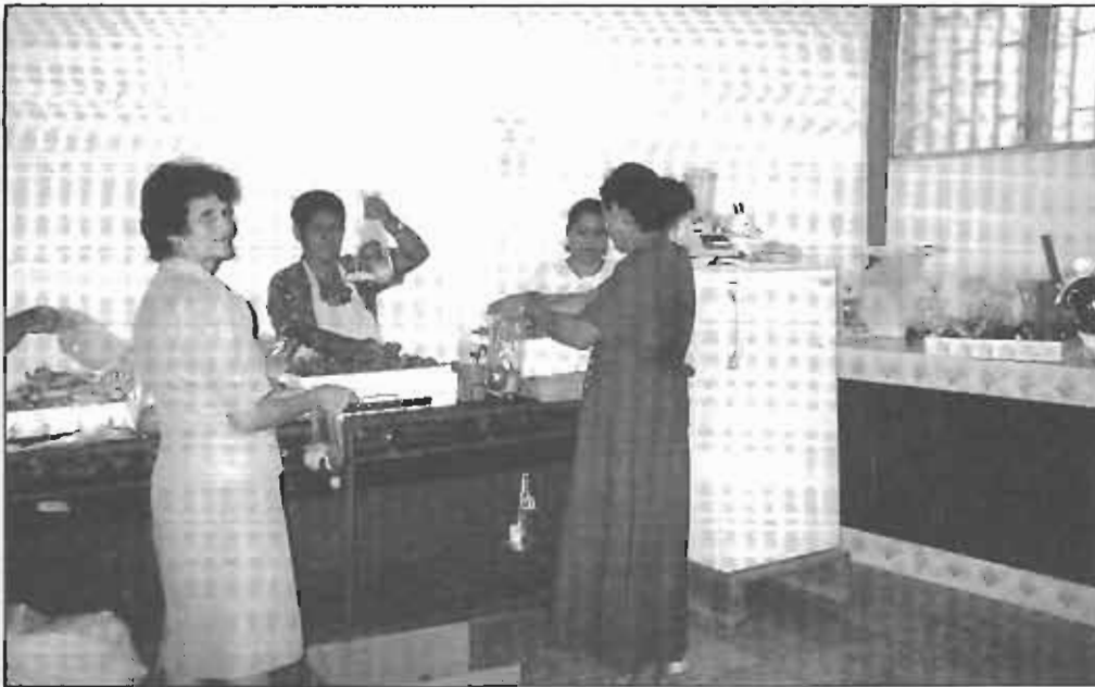
Making up bags of fruit for the elderly