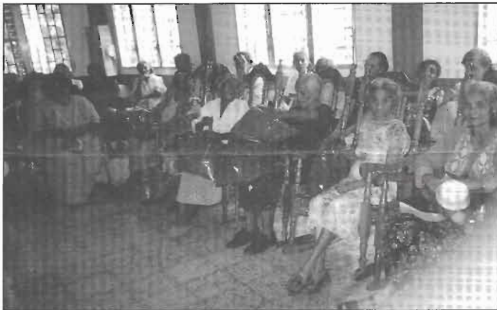
Elderly receiving Christmas bags