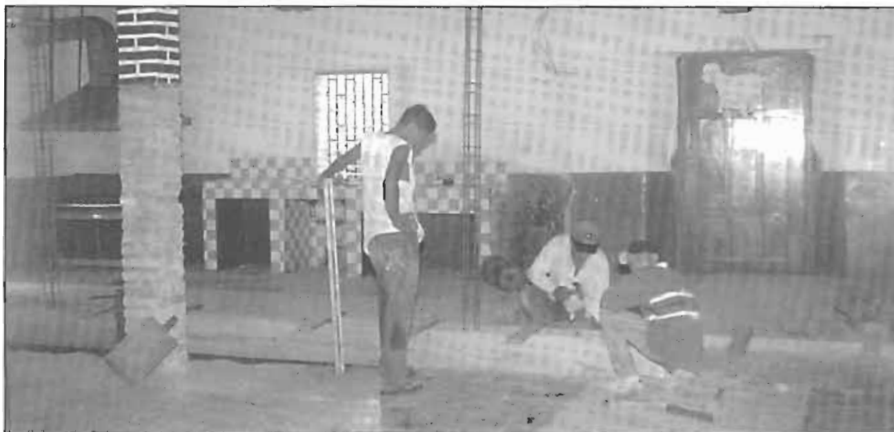
Re-modeling boys' dormitory