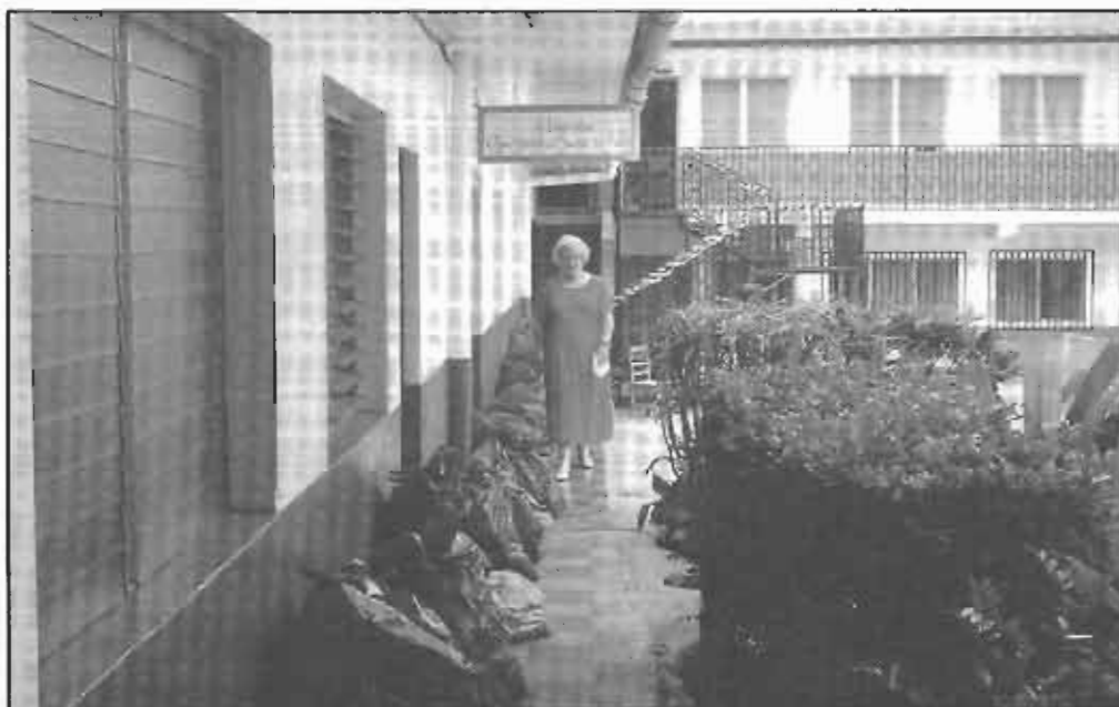
Christmas sacks for Opportunity Children