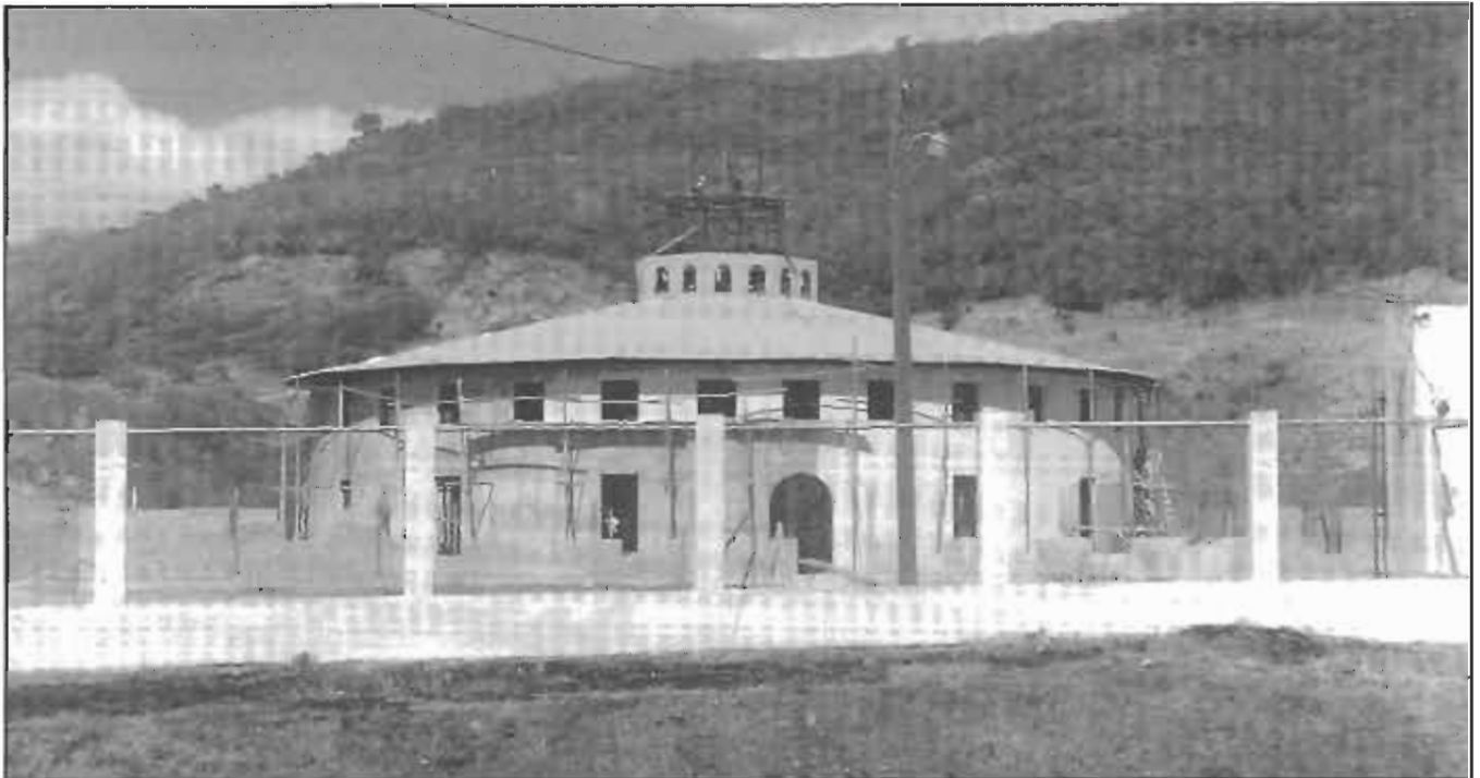
Tabernacle Construction Comali, Honduras

Christian Schools - Feed the Hungry - Church Planting - Child Sponsorship Bible Institute - Evangelism - Christian Radio Stations