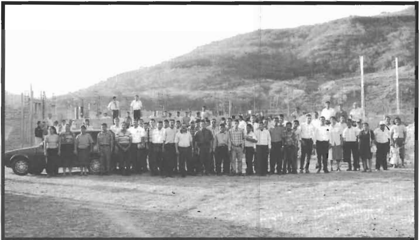
Good Samaritan Pastors standing in front of construction of Tabernacle and International Bible Institute in Camali, Honduras

Christian Schools - Feed the Hungry - Church Planting - Child Sponsorship Bible Institute - Evangelism - Christian Radio Stations