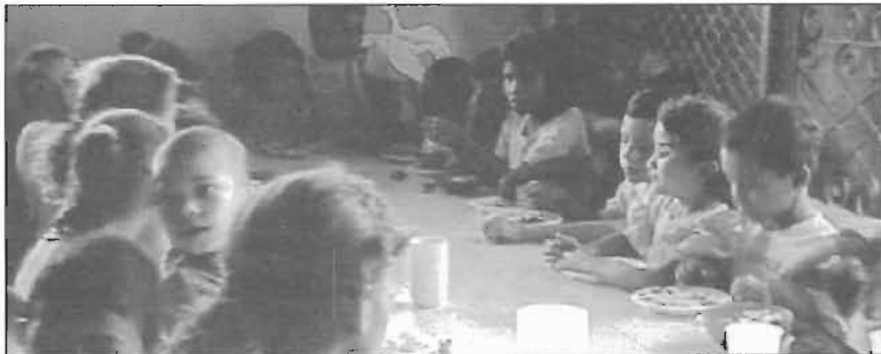
La Concepción de Maria Feed the Hungry Kitchen - Feeding 80 children daily