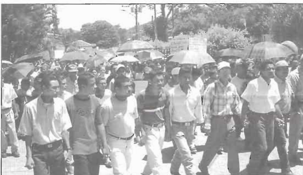
Guards, who work for Good Samaritan Baptist Missions and protect the things of God, marched hand in hand.