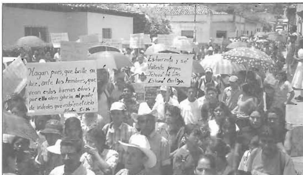
Town of San Marcos de Colón and surrounding areas came out in great numbers to show their appreciation to the missionaries for bringing them the Gospel.