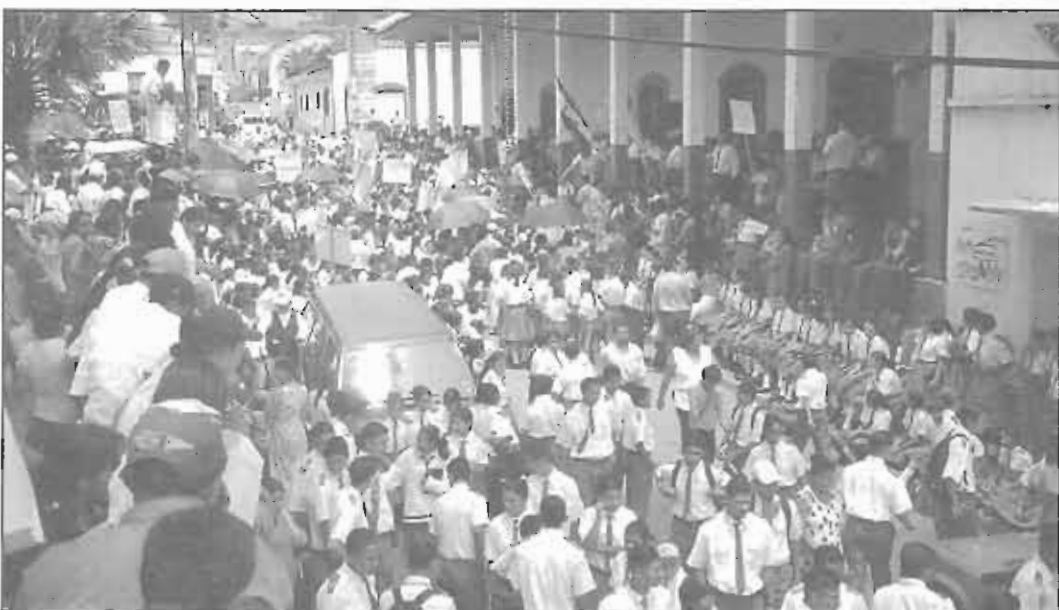
People said that never had there been a turnout of people like this...not even when the President came to San Marcos de Colón.