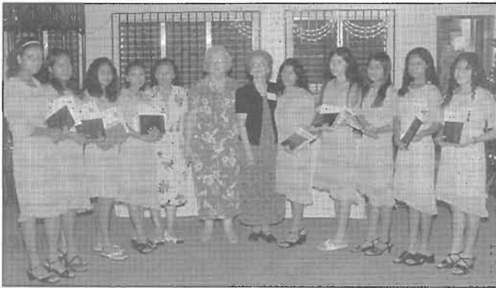
Nine young ladies graduated from the Good Samaritan Sewing Academy.