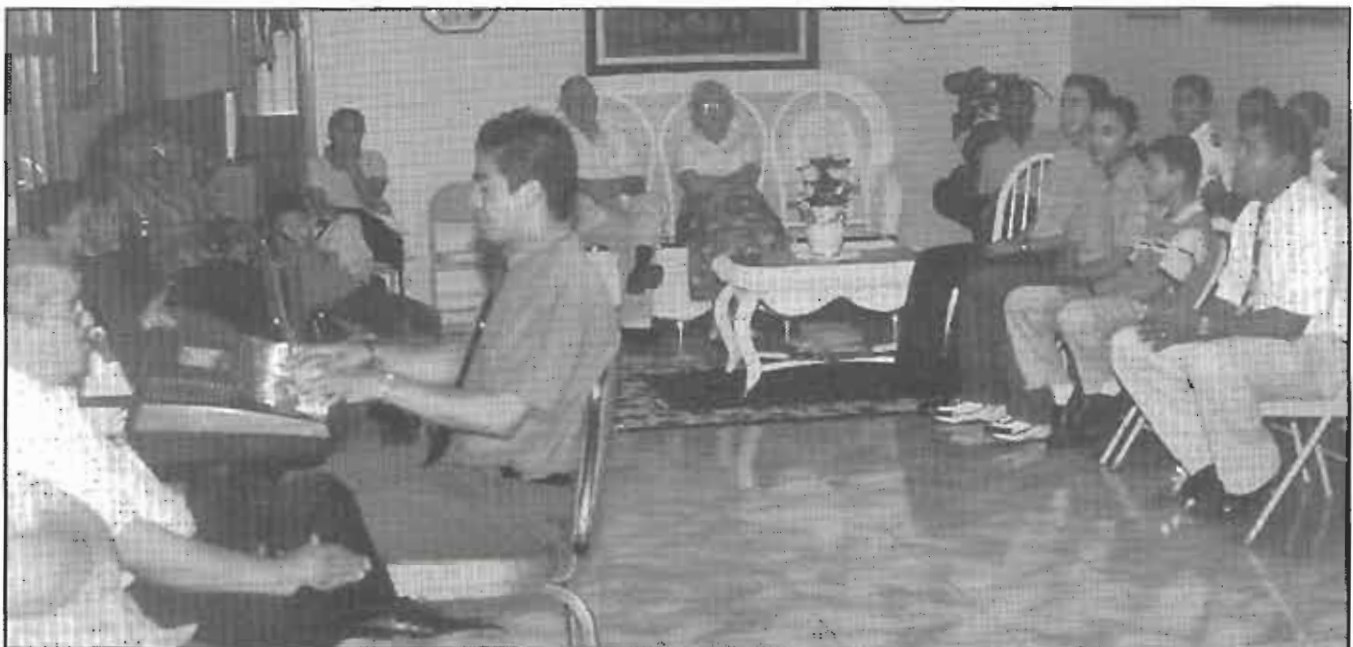
The Good Samaritan High School boys' basketball team was invited to participate in the Honduras Olympics and also chosen to carry the Olympic banner, which appeared on the front page of the sports section in the Honduras Newspaper. Here we celebrated their coming in 4th place. One of our students won the silver medal in most points shot during the games. The most important thing was the good testimony our boys left with all the officials.