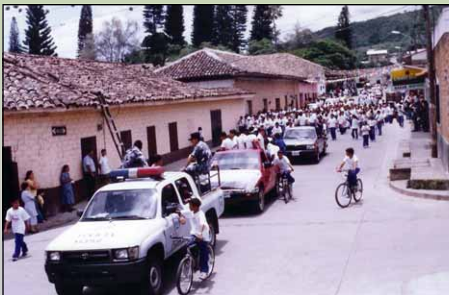
14th Anniversary Celebration of High School led by Local Police