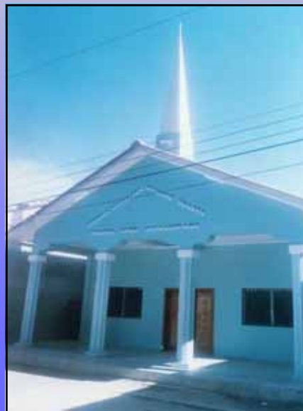
New church building in Concepcion de Maria, Honduras