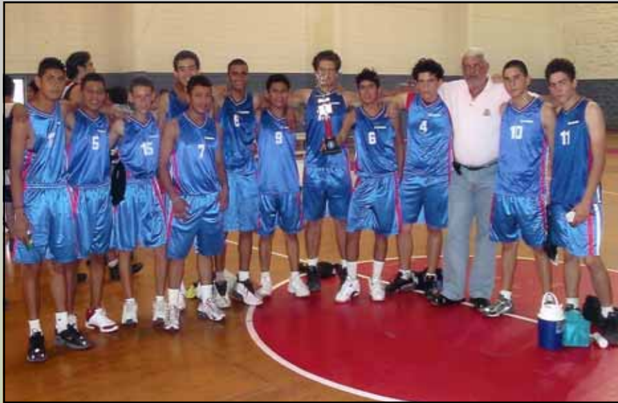
Good Samaritan High School boys basketball team wins second place in all of Honduras in the Basketball championship games