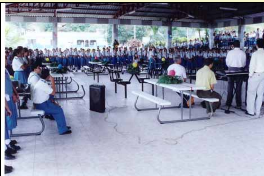
Students and Group from USA on hand for this special ceremony