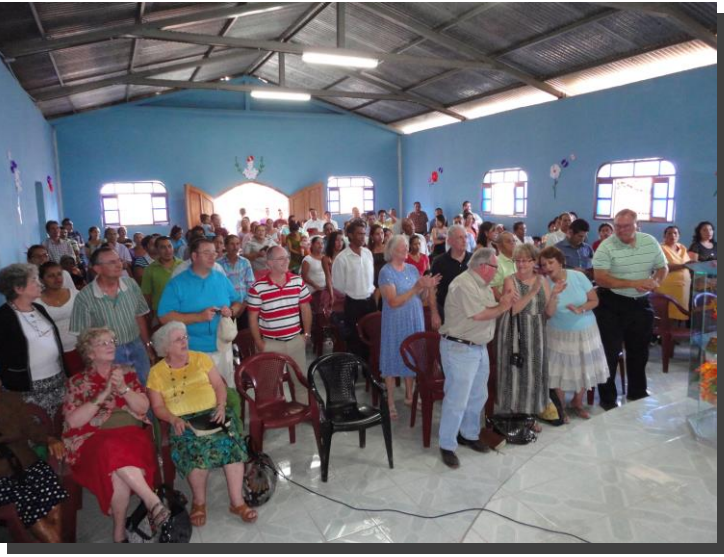
New church dedication in Los Calpules, Nicaragua.

Children in Caire receive book bags and school supplies from Crossroads Baptist in Valdosta, GA.