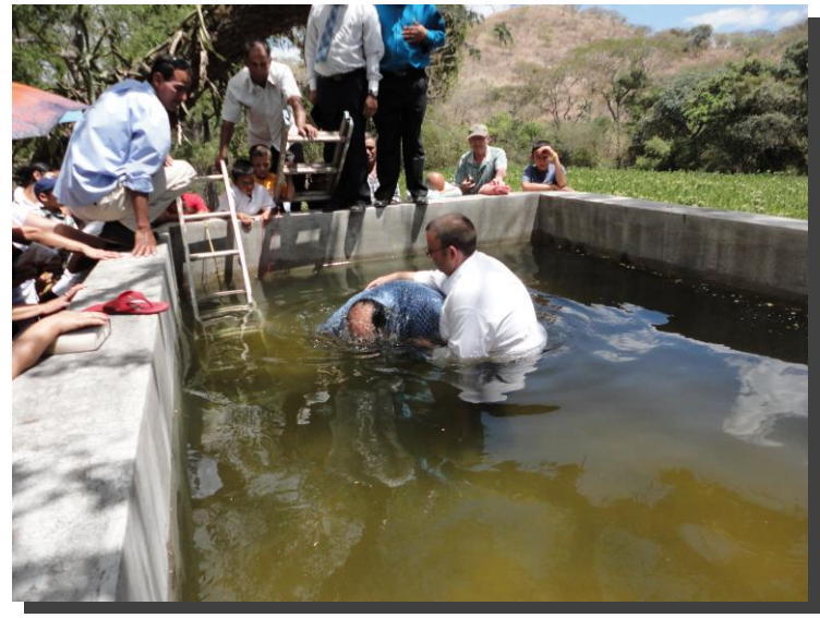
520 pound man being baptized in Pueblo Nuevo, Nicaragua.