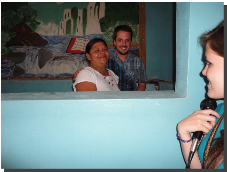
Happy Mother of high school student getting baptized in Caire - father baptized on same day