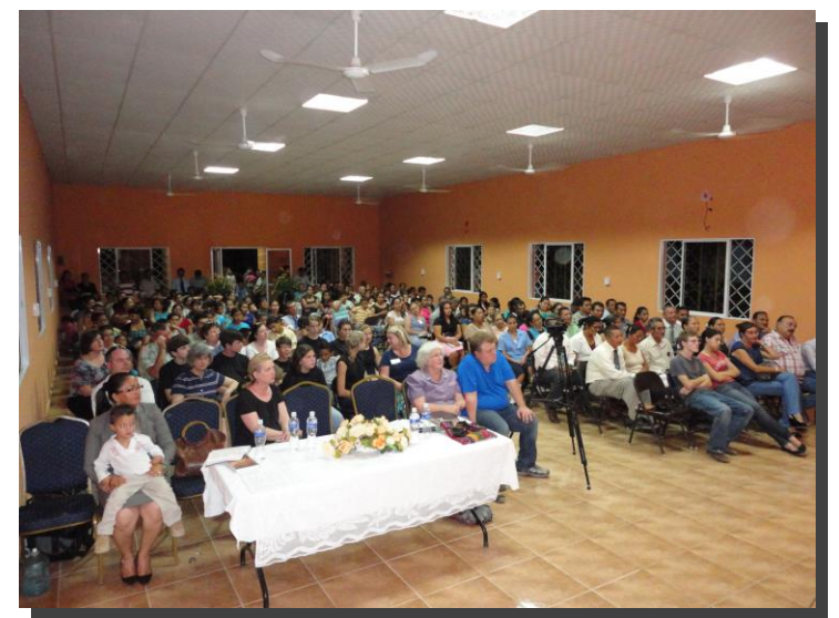
New church building dedication in Yusguare, Honduras.